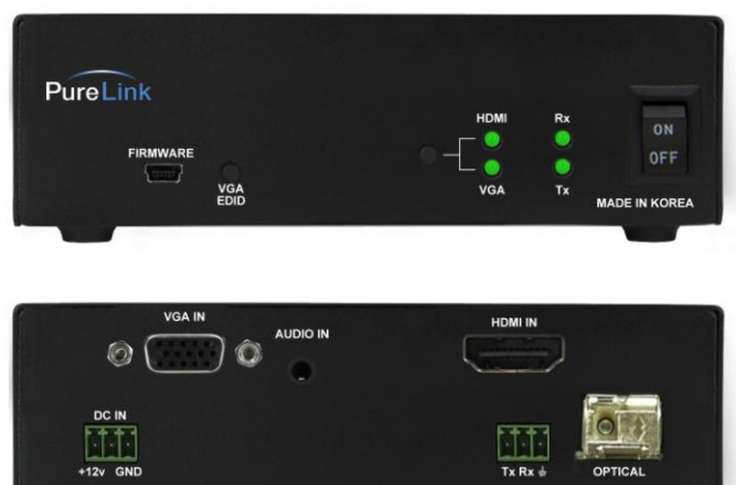
PM-FT102-U: PureMedia HDMI/VGA to Fiber Optic (1 LC) Extender Transmitter