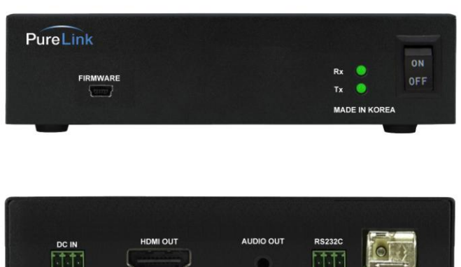
PM-FR101-U: PureMedia Fiber Optic (1 LC) to HDMI Extender Receiver