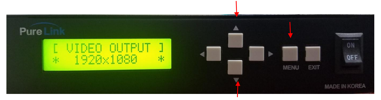
<PIC. UP and DOWN Button>

The functions can be selected by pressing UP, DOWN AND MENU(Enter) button on the front.