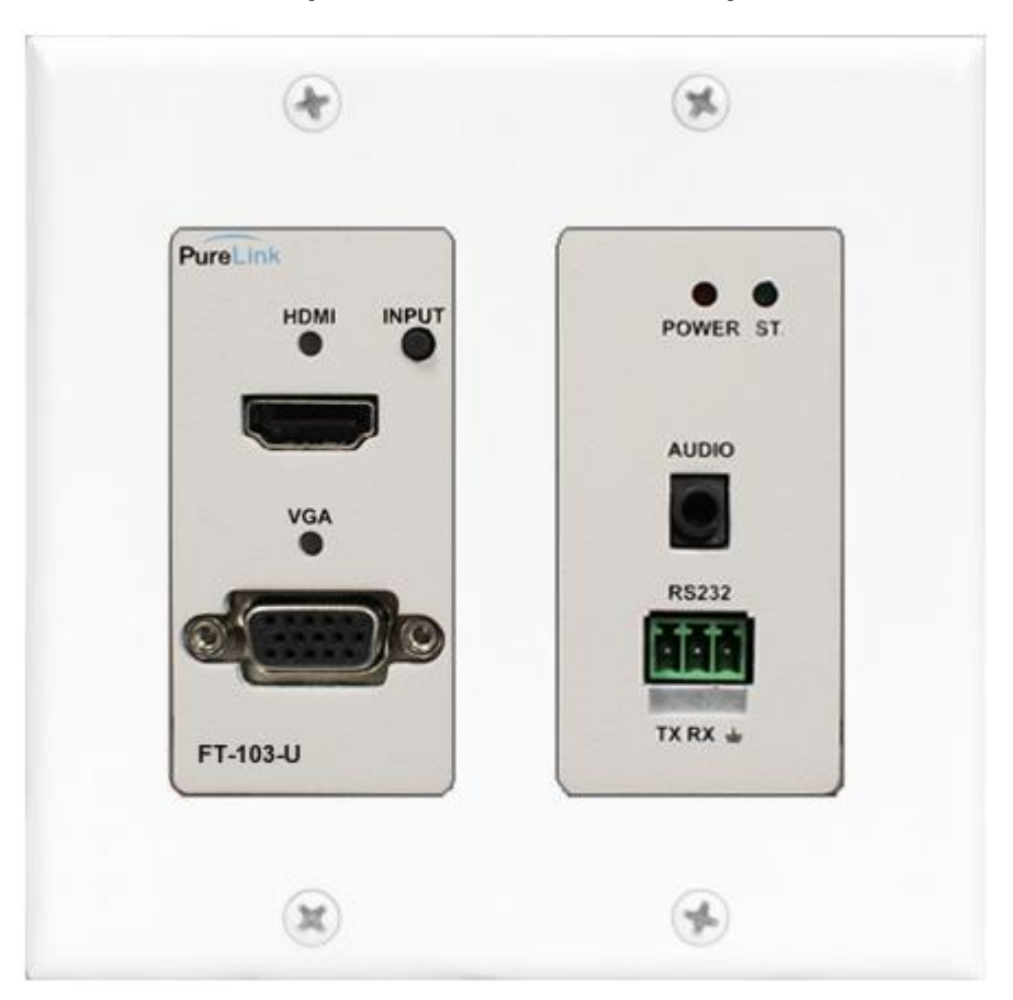
PM-FT103-U: PureMedia HDMI/VGA to Fiber Optic (1 LC) Extender Transmitter, Wall plate

32,808ft, Compatible with PM-FIS4-U input board