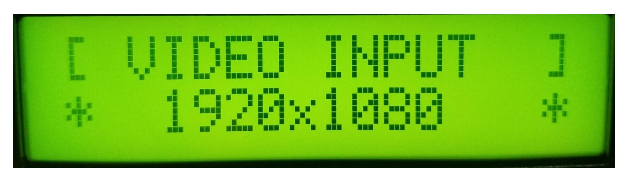
<PIC. Current video input resolution is 1920x1080>