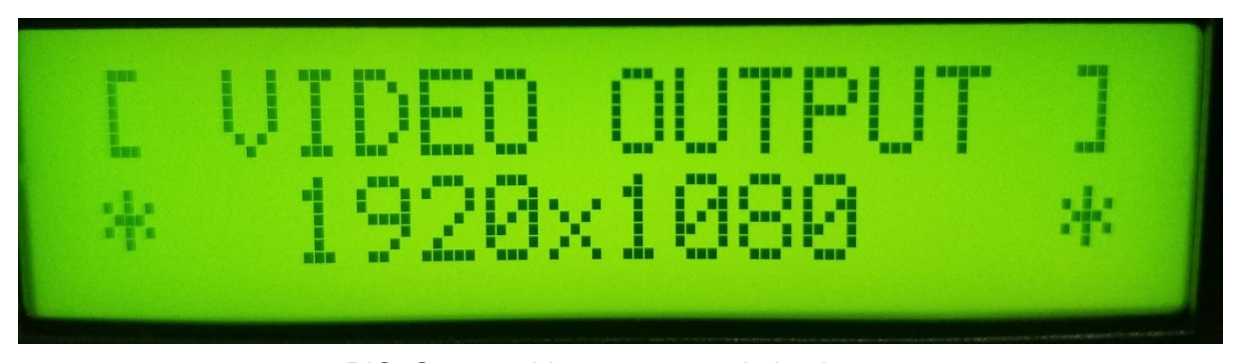
<PIC. Current video output resolution is 1920x1080>

If there is no signal coming in, it will be shown as No Signal on the video input.