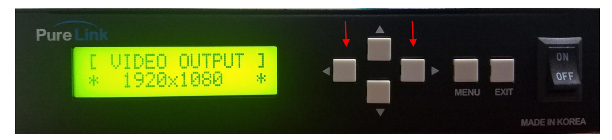
<PIC. Right or Left arrow>

Press right or left button on the front to toggle the information.