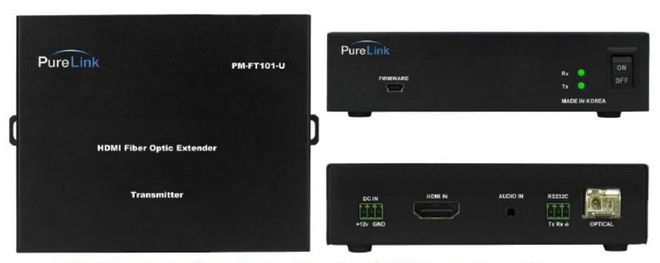
PM-FT101-U: PureMedia HDMI to Fiber Optic (1 LC) Extender Transmitter