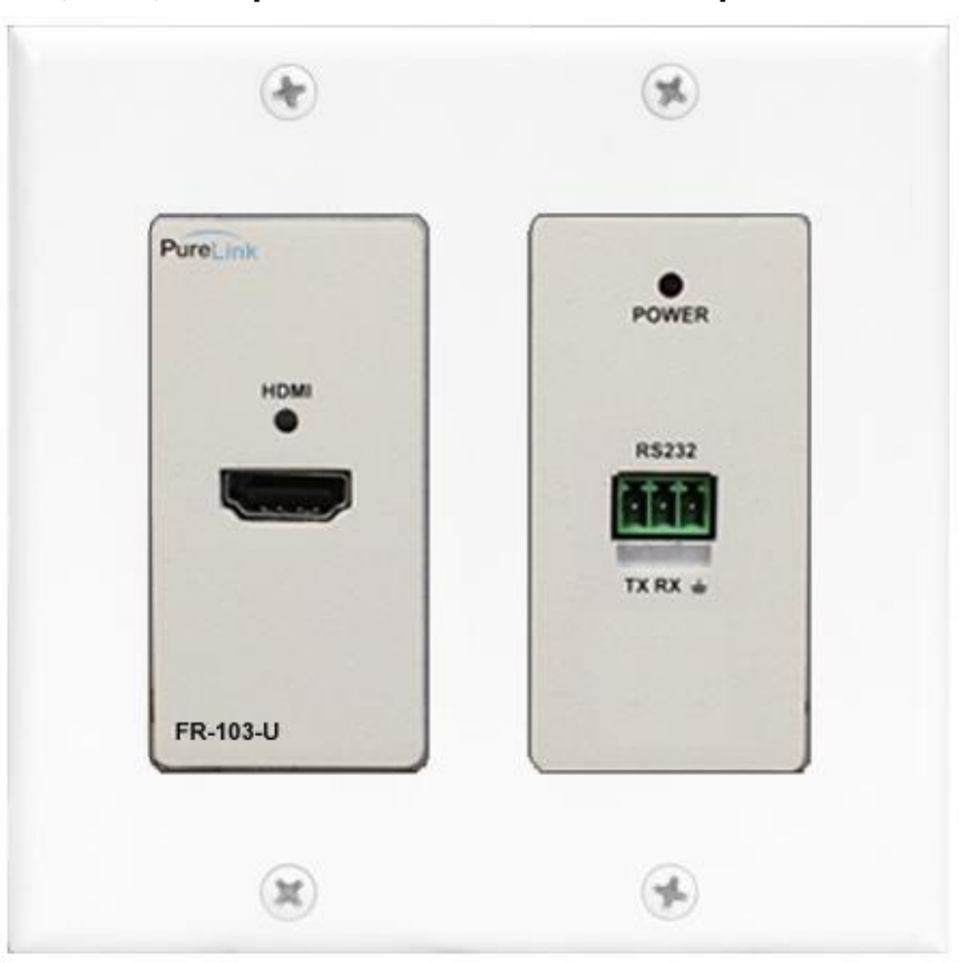
PM-FR103-U: PureMedia Fiber Optic (1 LC) to HDMI Extender Receiver, Wall plate

32,808ft, Compatible with PM-FOS4-U output board