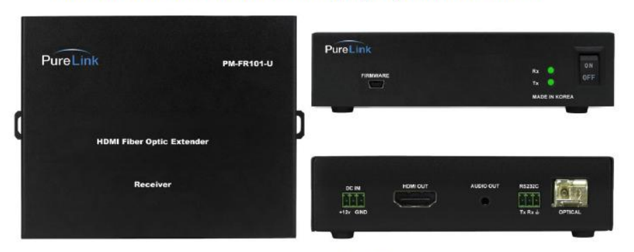
PM-FR101-U: PureMedia Fiber Optic (1 LC) to HDMI Extender Receiver