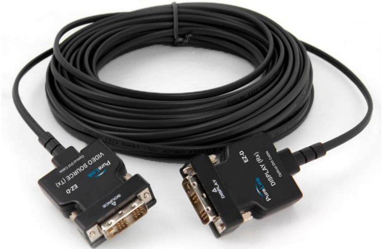
Figure 1 – EZ-D Series DVI over Fiber Optic Cable